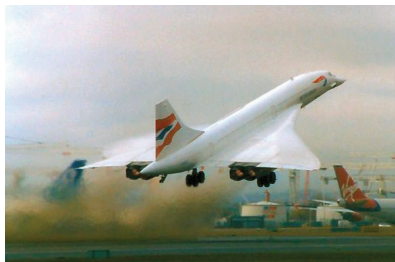
First to leave G-BOAC takes off for a last sub-sonic hop to Manchester.

At about 10:25 G-BOAC took off from Heathrow for the last time, with 82 British Airways Concorde staff on board as passengers. Flying subsonically, she took about 25 minutes to arrive and land at Manchester. Alpha Charlie was displayed on a taxiway that weekend, then moved into a hangar for decommissioning. In April 2004 she was put on display for visitors outside at the Runway Viewing Park. Finally, on 12 January 2009, G-BOAC was moved into a purpose-built hangar, which was officially opened on 26 February.